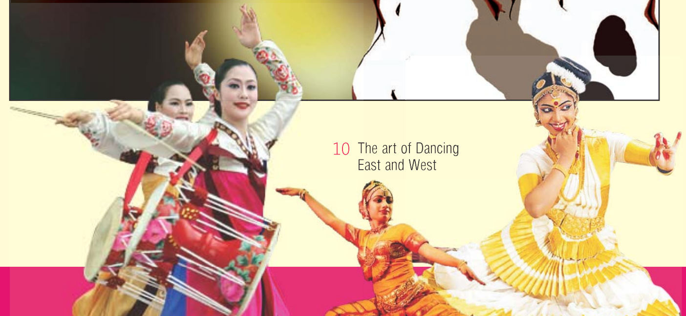
10 The art of Dancing East and West