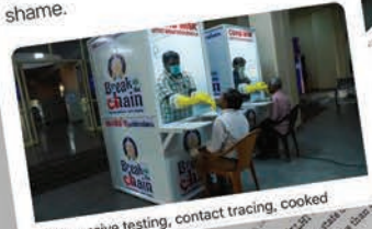
Aggressive testing, contact tracing, cooked

Kerala's COVID-19 response has been humane, caring and successful. They've kept their death toll to 2, and new cases are falling thanks to widespread community testing. It puts the so-called "first world" to shame.