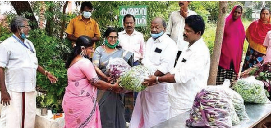
KSCDC veggies for community kitchens

given free of cost. On March 27, 528 more kitchens started functioning. The initiative is also being implemented through Local Self government institutions such as corporations, panchayats, ward-level committees and volunteers.