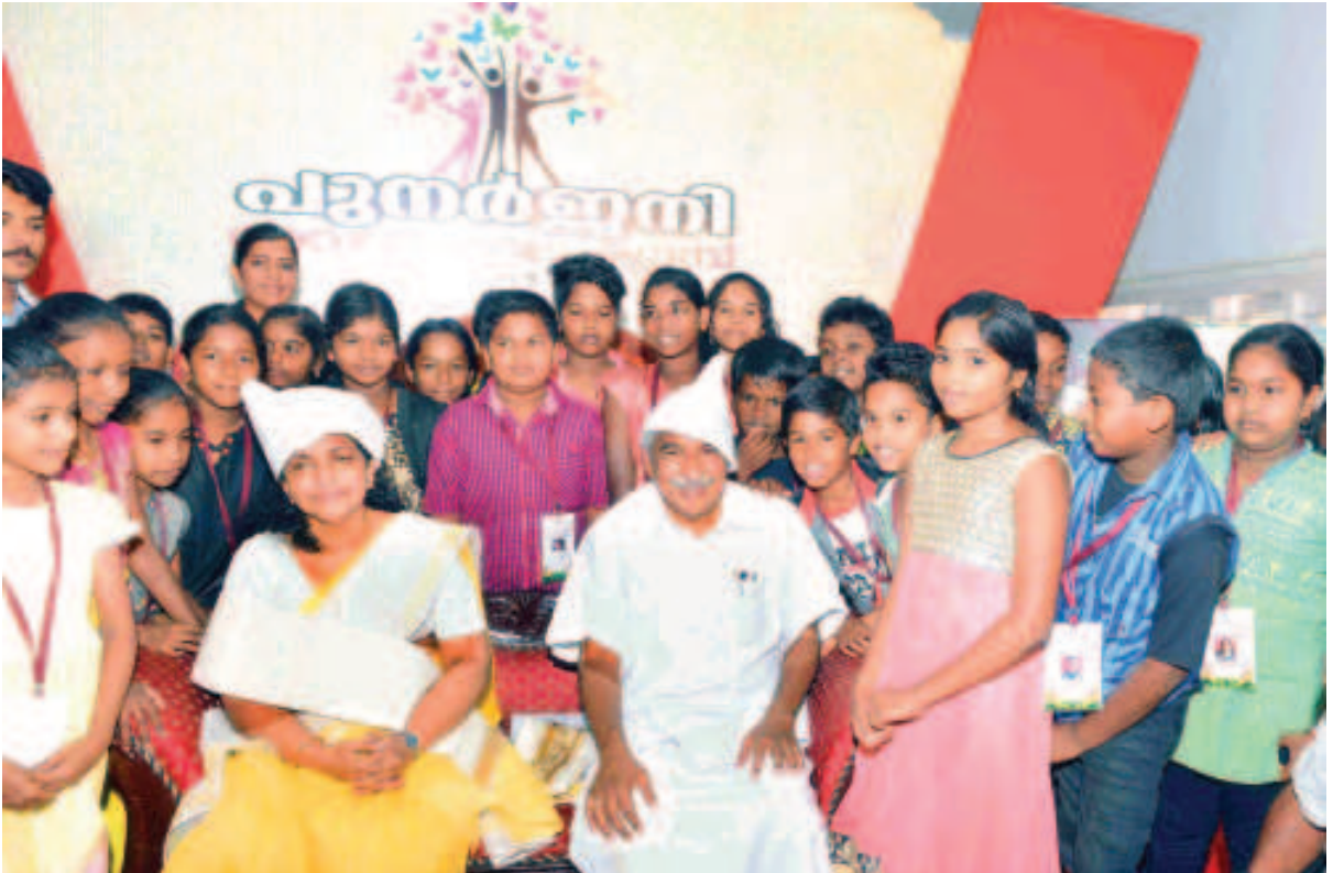
Chief Minister Oommen Chandy v visits a Summer Vacation Camp