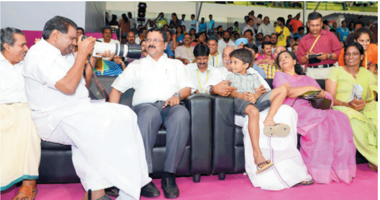
The CM in focus